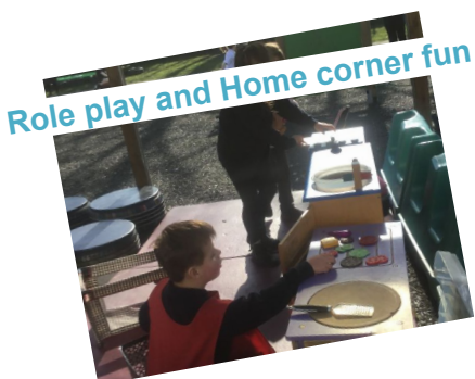
Role play and Home corner fun