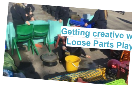
Getting creative with Loose Parts Play!