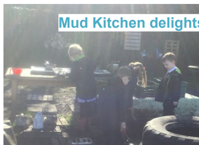
Mud Kitchen delights!