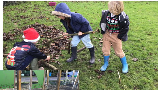
Table Tennis, Gravel or Bark chippings?

Do you have any of the above that you'd be happy to donate to school. Please contact the office.