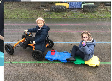
Table Tennis, Gravel or Bark chippings?

Do you have any of the above that you'd be happy to donate to school. Please contact the office.